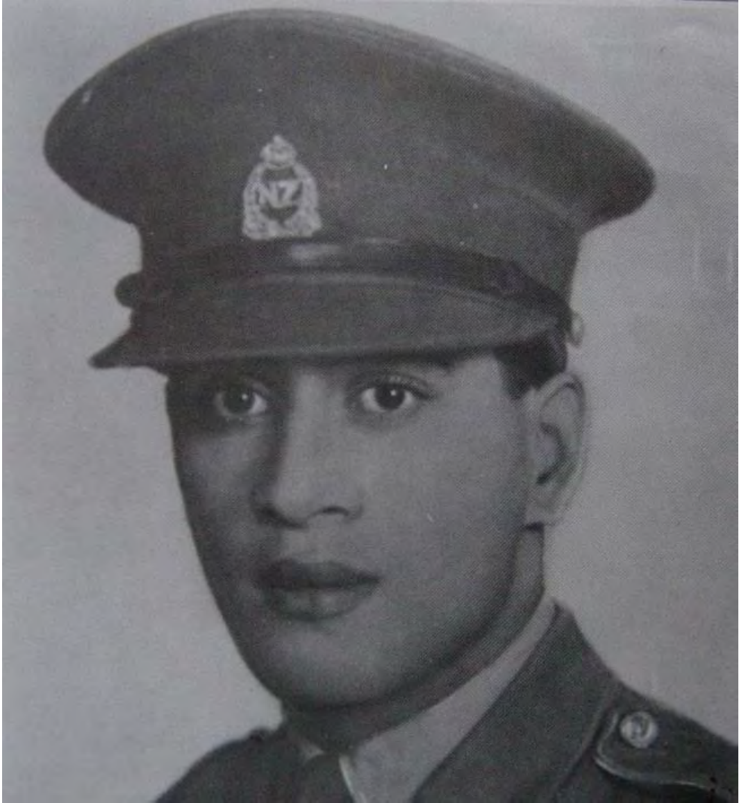
Figure 5: Lieutenant Aubrey Rota