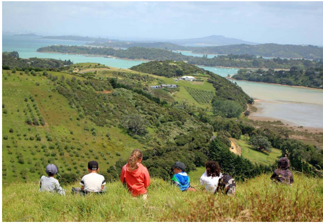
Ngāti Paoa rangatahi doing the Hikoi across Waiheke Island