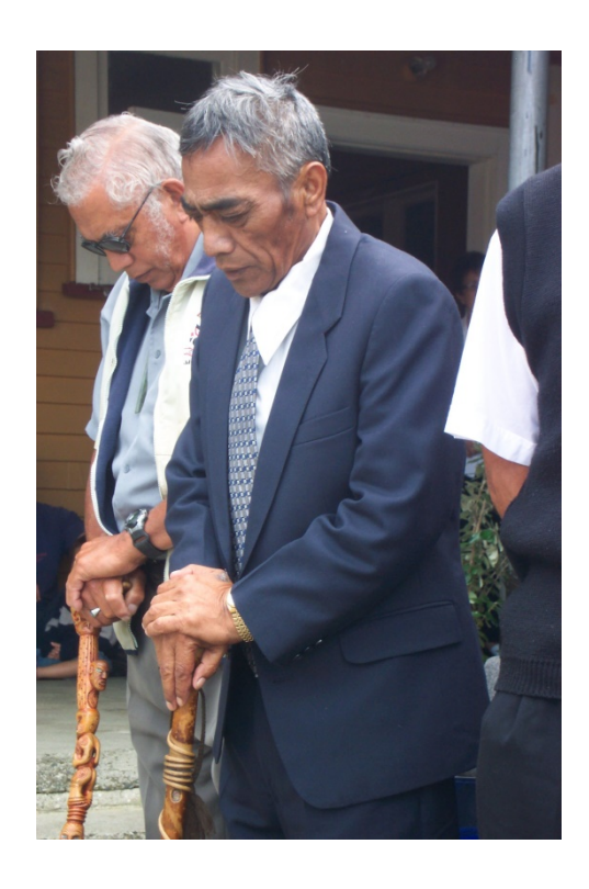
Ngāti Paoa kaumātua on the paepae at Wharekawa marae