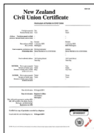
Civil union certificate